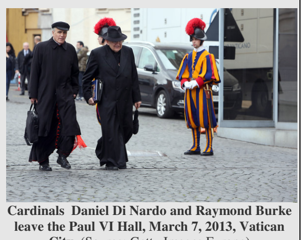
City.

Francis is thought to have refused to meet with his own cardinals at the consistory this weekend in order to avoid being confronted personally in a venue where it would be impossible to avoid answering the question whether he is or is not a Catholic. A pope